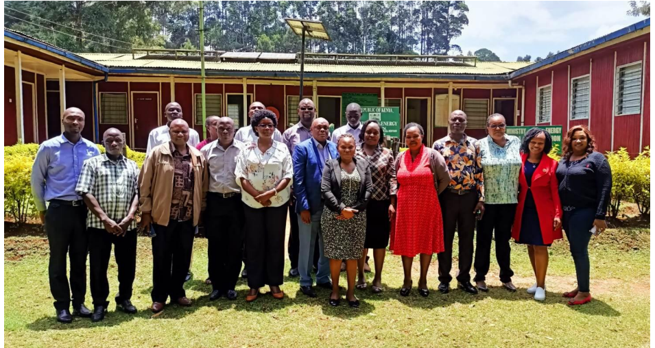
Kericho Energy Centre

Bitcoin and crypto: Bitcoin is a digital currency system that was created in 2009, by an anonymous person known as Satoshi Nakamoto.